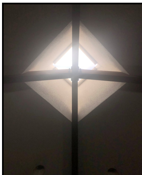
Skylight in our sanctuary